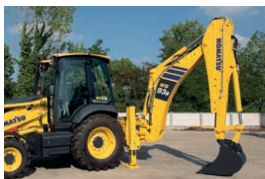
S-shaped boom makes operations easier when working close to obstacles and walls