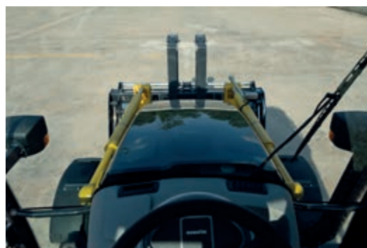
Lateral muffler and low front bonnet height guarantee unrivalled front visibility for operator