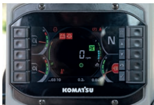
New 7" multi-function monitor with fuel consumption indications and 15 built-in languages