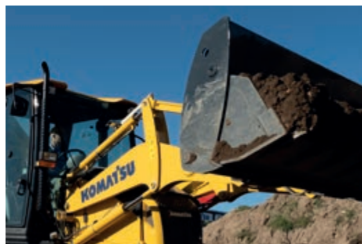
Exclusive parallel loader linkage